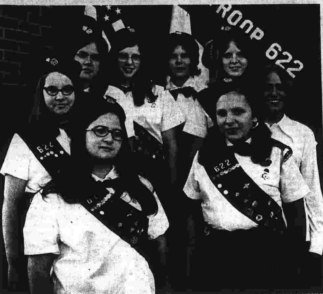
They Earn Top Scouting Award