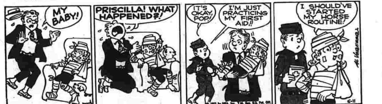
BY PHIL KROHN