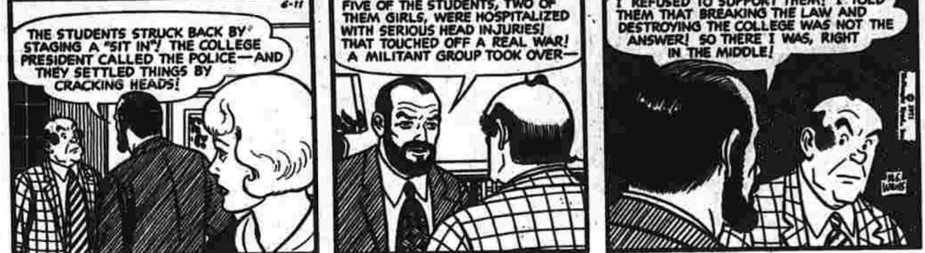
BY NEG COCHRAN